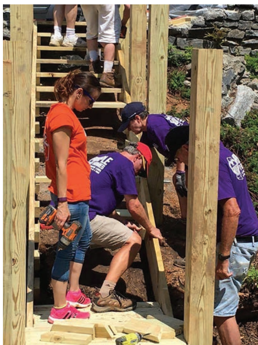
Volunteers from Golden Corner Chapter in South Carolina, build a staircase for a Veteran with Parkinson's Disease