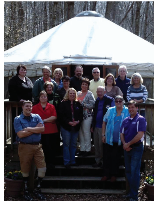
Purple Heart Homes Staff attend a Strategic Development Meeting at Cool Spring Center in Cleveland, NC